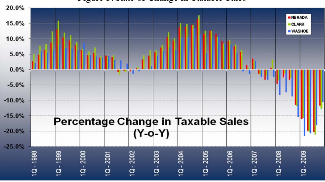
Figure 3: Rate of Change in Taxable Sales