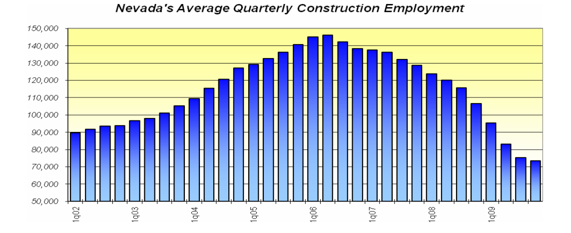
Figure 1: Construction Employment

Low unemployment rates bottomed out in the state around the same time period, initially driven higher by unemployment in construction, but with job losses in other industries soon contributing to the change (see Figure 2).